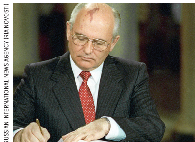
Soviet President Mikhail Gorbachev, 1990.