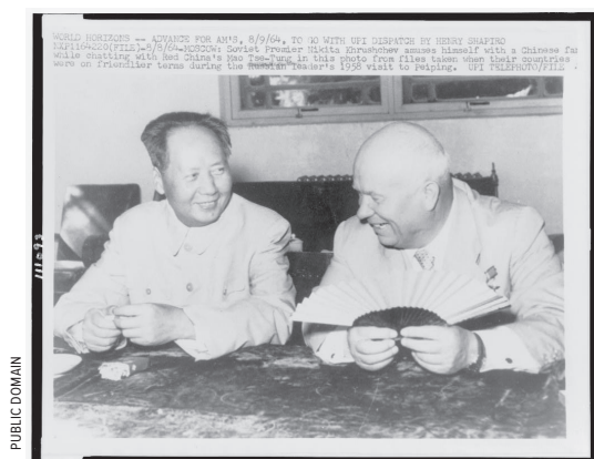
Mao Tse-tung (left) and Nikita Khrushchev during the Russian leader's 1958 visit to Peking.

Mutual embrace of communism is not enough to sustain warm political relations between China and Russia in the Cold War years.