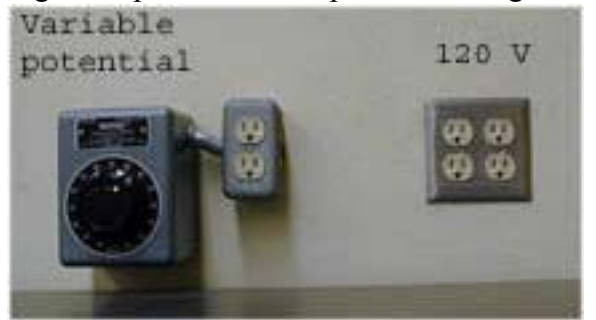
Fig. 2. Electrical outlets in rooms 364 and 361.

On the lab desks you will find metal boxes, each with three light bulbs, as shown in Fig. 1. The Victorian bulb on the left side of the box has a carbon filament, the lamp at the center, with two horizontal flat electrodes is the neon lamp, that on the right is the tungsten lamp. Make sure that the power switch on the front face of the box is in the OFF position. Next, plug in the power cord attached to the box into an outlet controlled by a variac, see Fig. 2. Connect an ammeter and a voltmeter to one of the lamps. The ammeter should be connected in series – connect the ammeter to the red posts on the box. The voltmeter should be connected in parallel, between the red and black posts, as shown in Fig. 1. Make sure that the instruments are set to measure AC current and potential, respectively. If you will use desktop multimeters, plug them into the 120 V outlets, not into the outlets of variable potentials! Ask the assistant to check the connections and only then turn the switch ON.