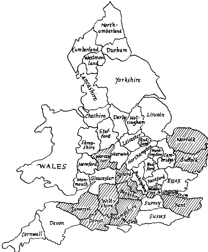
Figure 1 English Origins of Passengers on Seven Ships to Massachusetts, 1635–1638