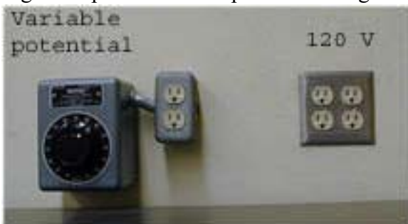
Fig. 2. Electrical outlets in rooms 364 and 361.

On the lab desks you will find metal boxes, each with three light bulbs, as shown in Fig. 1. The Victorian bulb on the left side of the box has a carbon filament, the lamp at the center, with two horizontal flat electrodes is the neon lamp, that on the right is the tungsten lamp. Make sure that the power switch on the front face of the box is in the OFF position. Next, plug in the power cord attached to the box into an outlet controlled by a variac, see Fig. 2. Connect an ammeter and a voltmeter to one of the lamps. The ammeter should be connected in series – connect the ammeter to the red posts on the box. The voltmeter should be connected in parallel, between the red and black posts, as shown in Fig. 1. Make sure that the instruments are set to measure AC current and potential, respectively. If you will use desktop multimeters, plug them into the 120 V outlets, not into the outlets of variable potentials! Ask the assistant to check the connections and only then turn the switch ON.